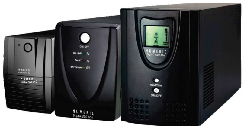
Digital LI Series 600 VA - 2 KVA

The Digital LI Series delivers quality power to protect the loads, and functions with a high electrical efficiency. With its superior performance the Digital LI Series stands far above the contemporary UPS systems.