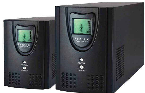
Digital LI SW HR UPS Series 1 kVA - 3 kVA